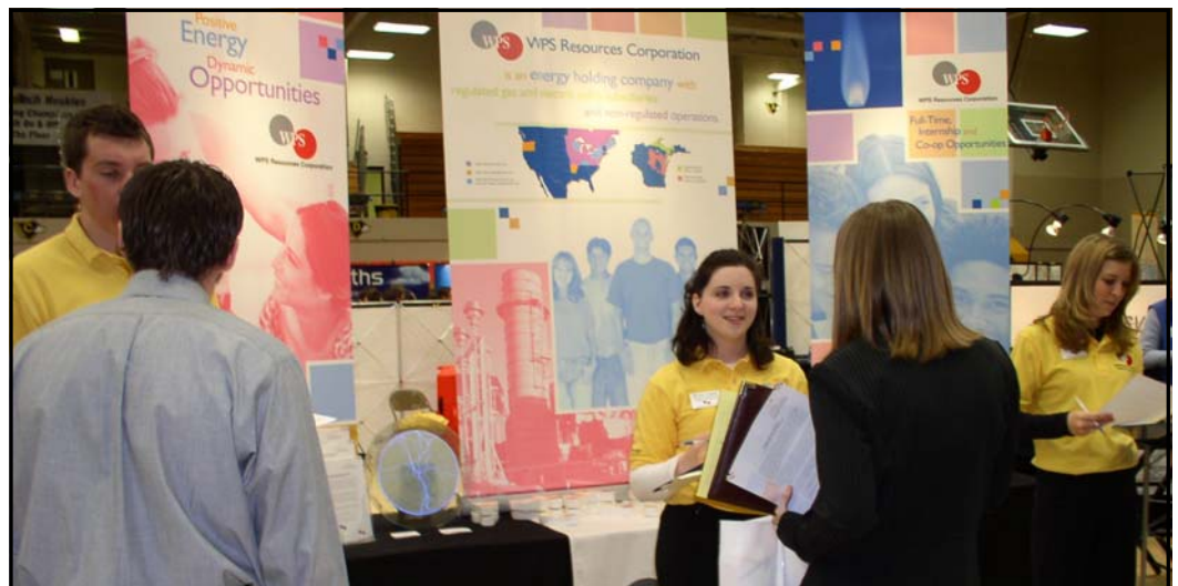
Recruiters from WPS Resources Corporation discuss career opportunities with potential employees at Michigan Tech's Winter Job Fair held on February 22, 2005.

Thanks to the many individuals and departments who assisted and donated office space for the interviewing process.